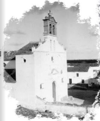
The entry of San Ignacio Church