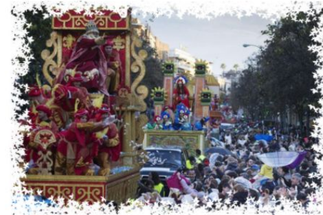
The Three Wise Men parade