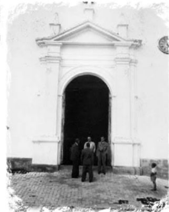
Church San Ignacio