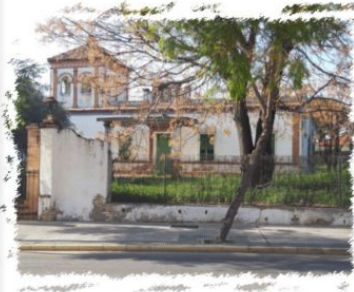
A house in our town