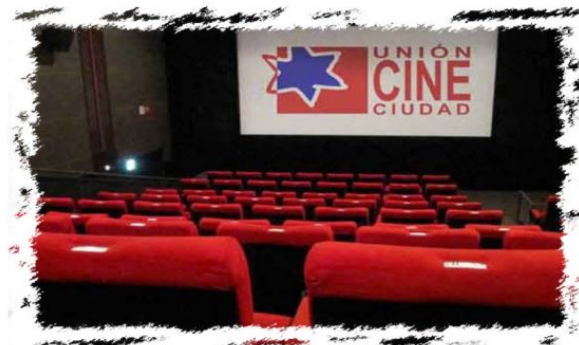
Metromar cinema (the shopping centre in front of our school)