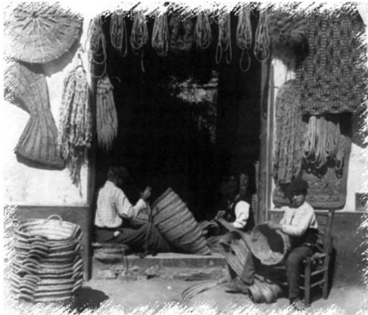
Rope making shop