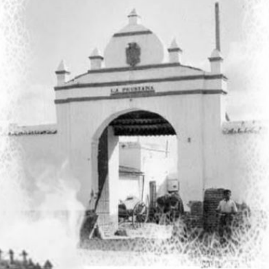
The entry from inside Prusiana