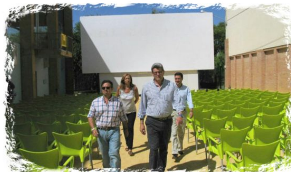
Mairena's summer cinema