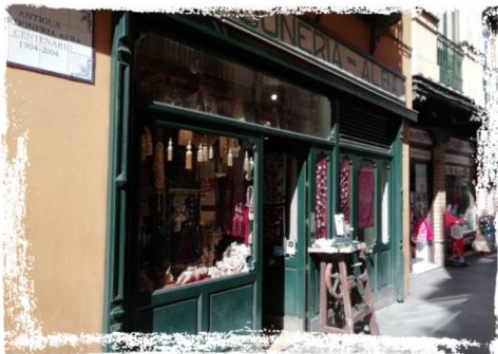
Rope making shops