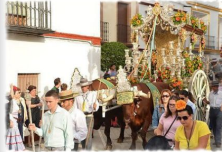
El Rocío (religious festivity)