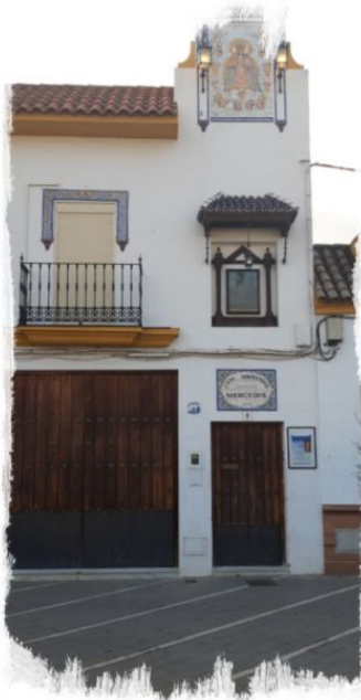
The current tiles in the wall