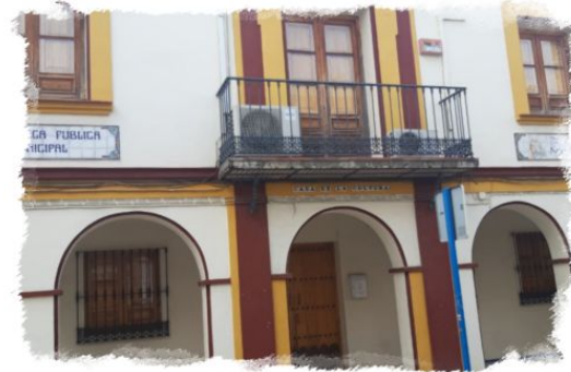
The ancient Town Hall is now a library